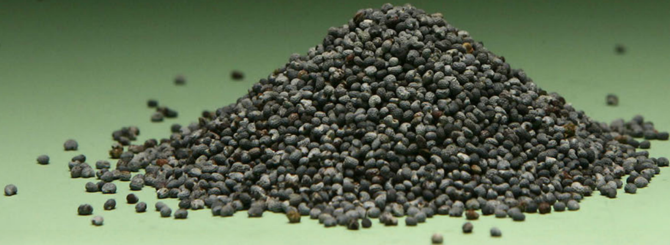
Figure 1 – Transformation of protein in rapeseed in the Farmet technology.